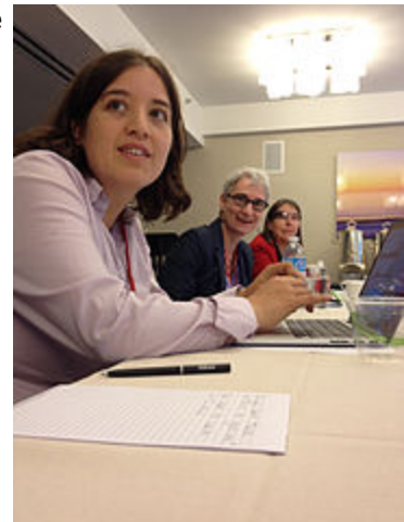
Image: Meeting with the Association for Psychological Sciences (APS) in San Francisco

Our focus this July has been to develop plans for making our partnerships with academic associations more productive. Though we have supported instructors and courses from the American Sociological Association (ASA), the Association for Psychological Sciences (APS), and the National Communication Association (NCA) in the past, we now have more resources to strengthen those relationships. We plan to support these and other organizations in the following ways: